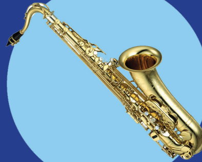
4. your abilities