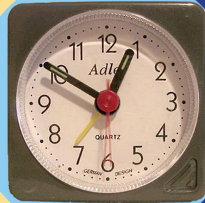
3. your time