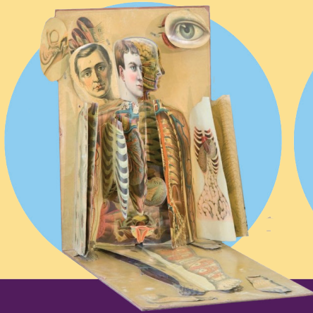
2. your body