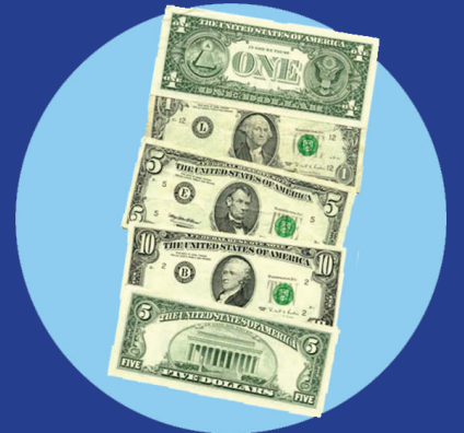
5. your money and possessions

You get to enjoy all these gifts while using them wisely for God's purposes.