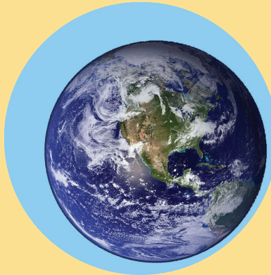
1. the earth

Not only did God make us, He paid with His life to buy us back after Satan took us as hostages. "You do not belong to yourselves. Christ has paid the price for you" (1 Corinthians 6:19, 20).